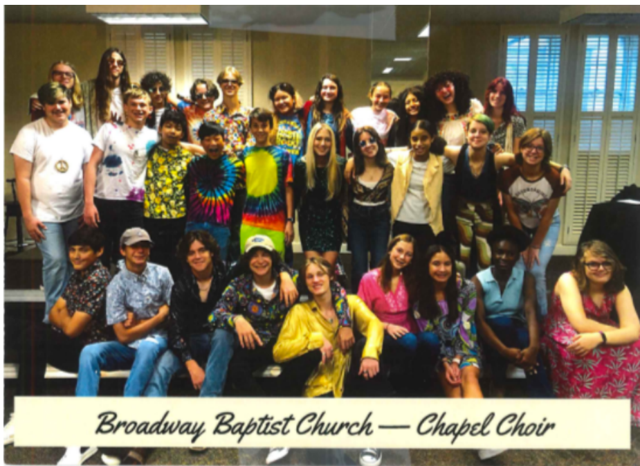
Broadway Baptist Church — Chapel Choir

July 3rd and 4th, the Broadway Baptist Chapel Choir from Ft. Worth, TX stayed at IBC as they traveled through the Southeast on choir tour. They sang at the National Museum of African American Music the morning of July 4th and spent the rest of the holiday enjoying R&R at Nashville Shores.