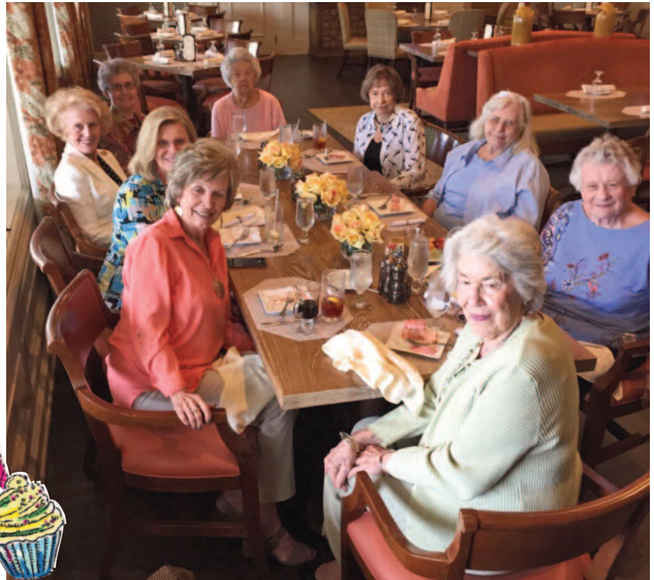
The Grigsby Sunday School Class recently celebrated birthdays with lunch together.