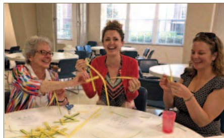
The Palm Cross Crews