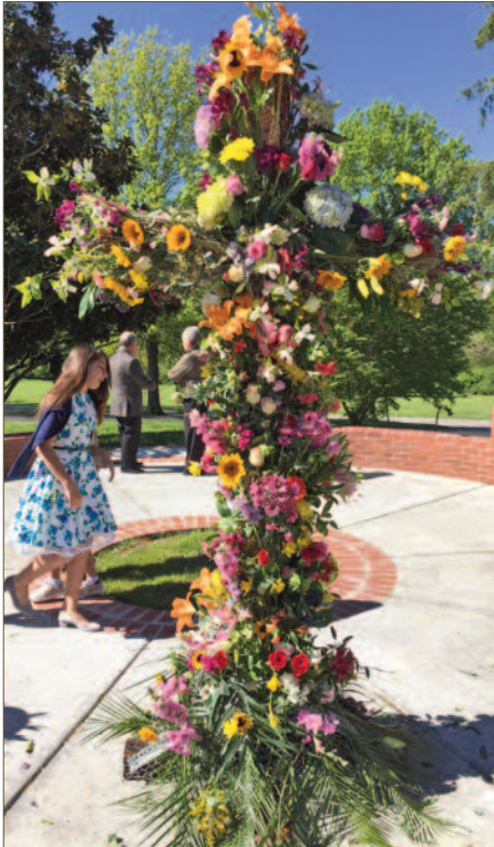
Flowering the Cross on Easter