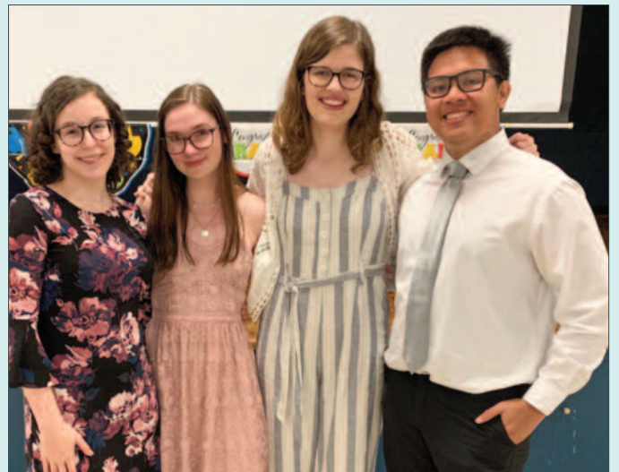
Our high school graduates were honored at a church-wide luncheon on May 19.