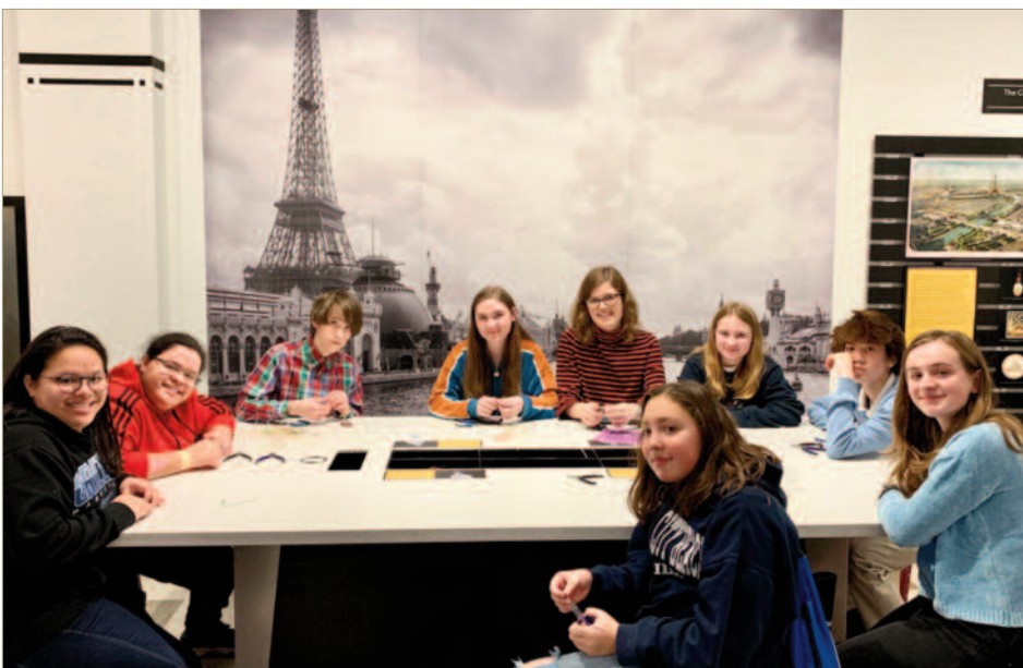
The Immanuel Youth enjoyed their recent field trip to the Frist Art Museum!

The Sanctuary Study Group (SSG) will present a brief overview of the project at the end of worship on February 10 with further presentation and discussion on Wednesday, February 13. On Sunday February 17, there will be a special called business meeting at the conclusion of worship in order to vote on the proposal and related capital campaign. While it is possible that beginning the project in a timely manner might require obtaining a line of credit or the church’s tapping into short-term sources of funding, it is the hope of the Stewardship Committee that quicker funding of pledges to the capital campaign can make that unnecessary. We trust that our gratitude for the ongoing ministries of our church will be reflected in our giving.