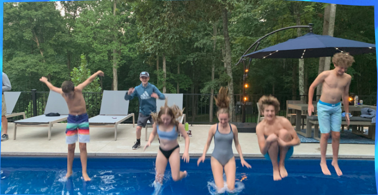
Hit the water!