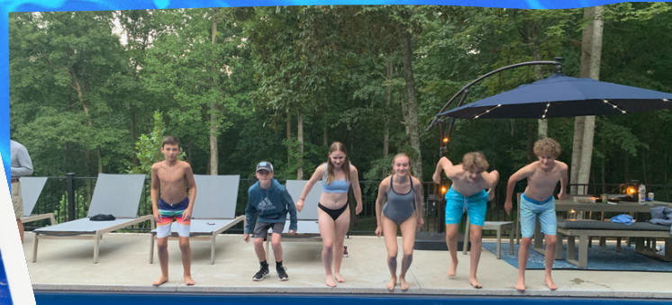
On your mark!