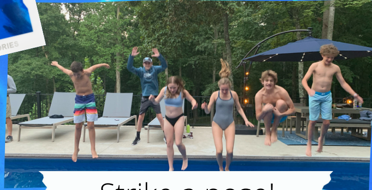
Strike a pose!