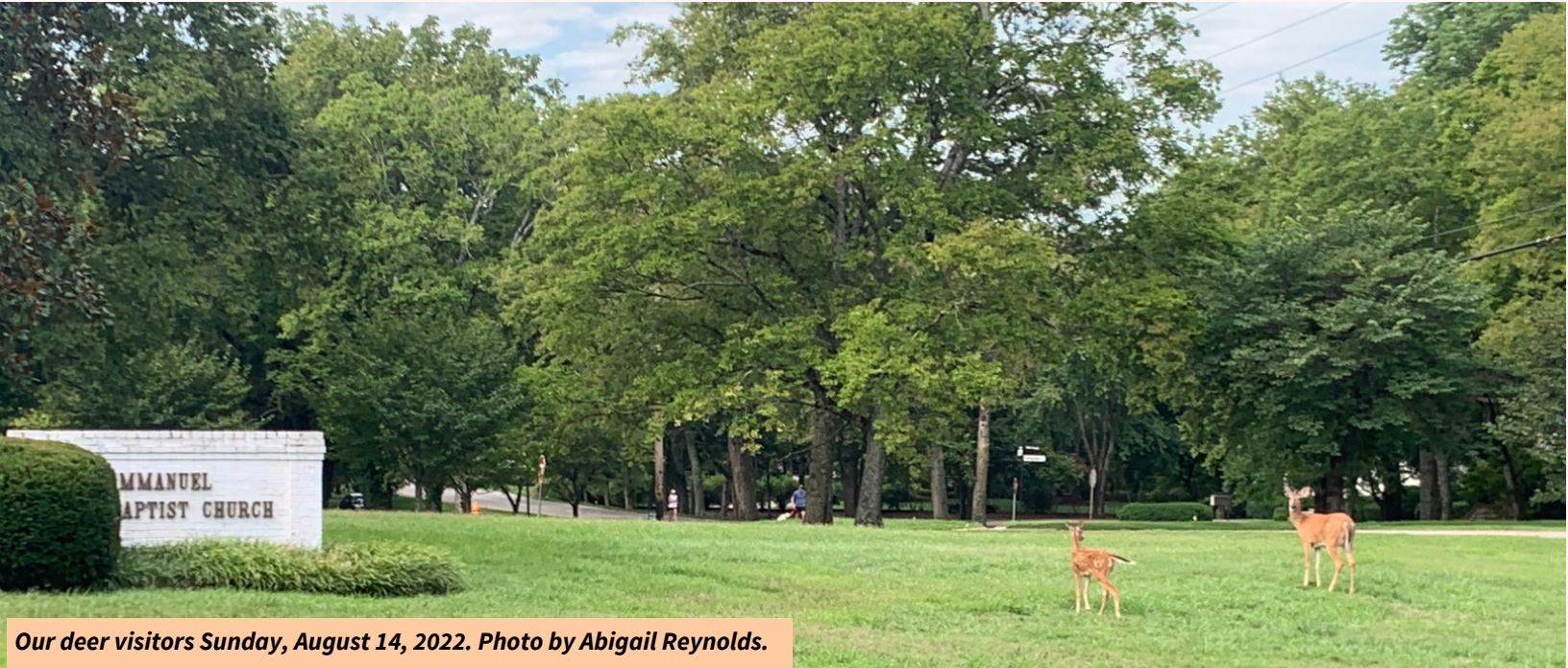
Our deer visitors Sunday, August 14, 2022.