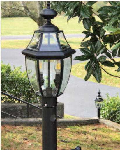
New and much improved outside lighting near the Honeywood entrance.