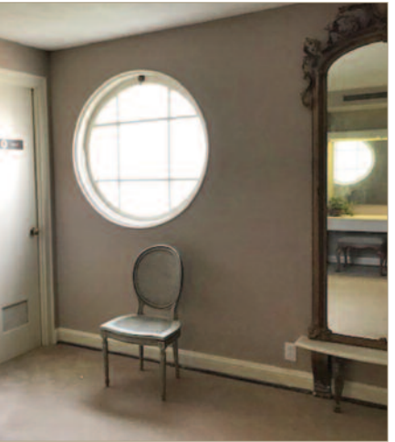
Refurbishing the walls in the Bride's Room.