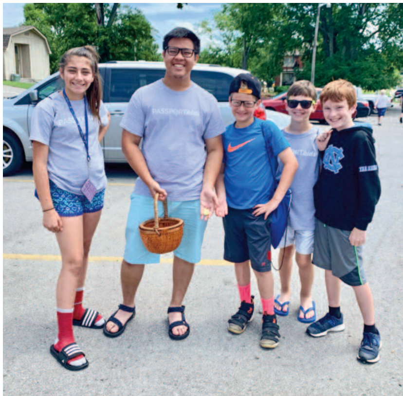
Passport Kids Camp at Cumberland University