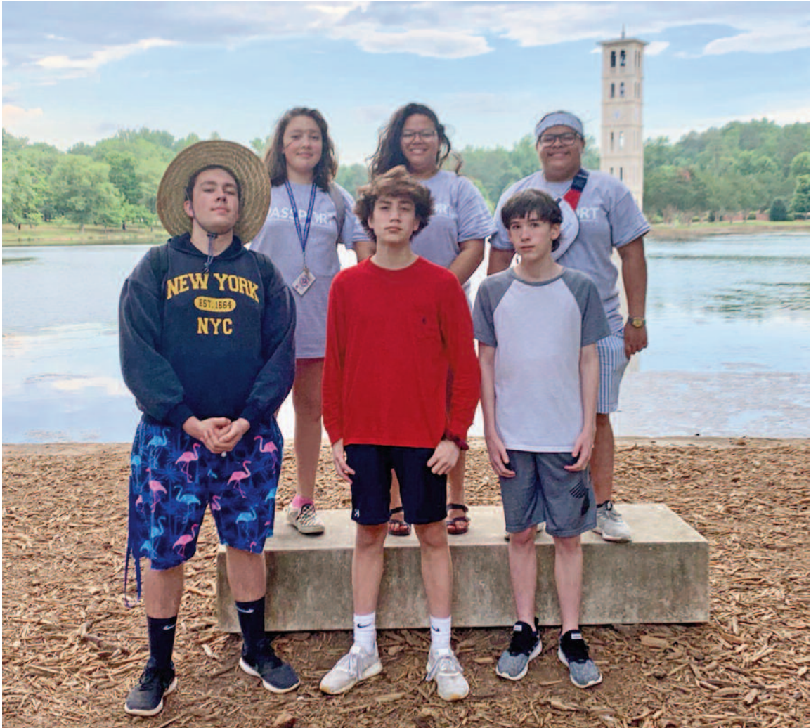
Passport Missions at Furman University