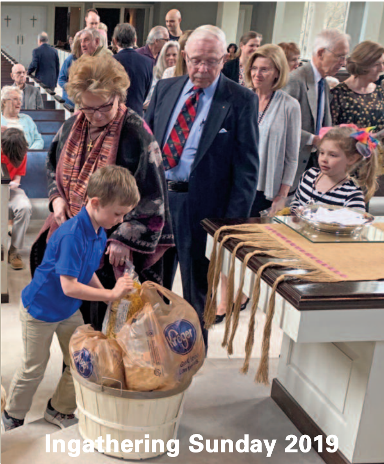
Ingathering Sunday 2019