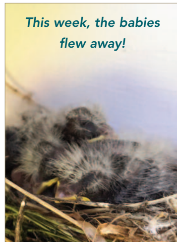
This week, the babies flew away!

Here is what some of us have been doing . . .