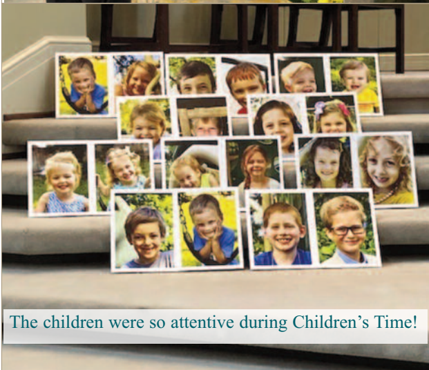
The children were so attentive during Children's Time!