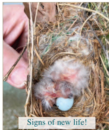
Signs of new life!

Approximately 65 members of our church family came by the church to help flower the cross this year!